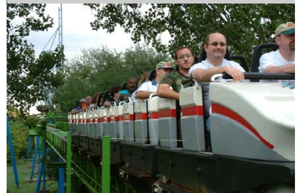
Some early morning Shock Wave ERT to wake everyone up.